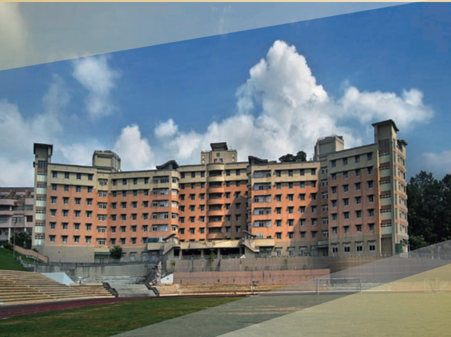
National Kaohsiung Normal University

| Heping Campus | No.116, Heping 1 st Rd., Lingya District, Kaohsiung City 80201, Taiwan (R.O.C.)